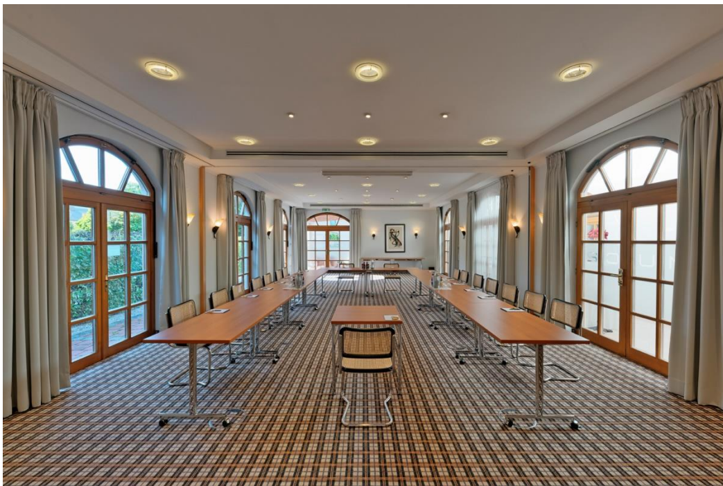
Munich I + II

The room can be enlarged to approx. 95m 2 with room Munich I.